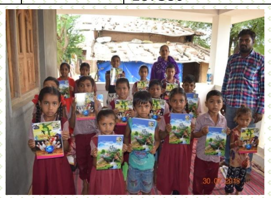
Educational Tour for School Children:

GMDC, Rajpardi has provided fund of Rs 52000/- for educational tour of students of 5 primary schools.